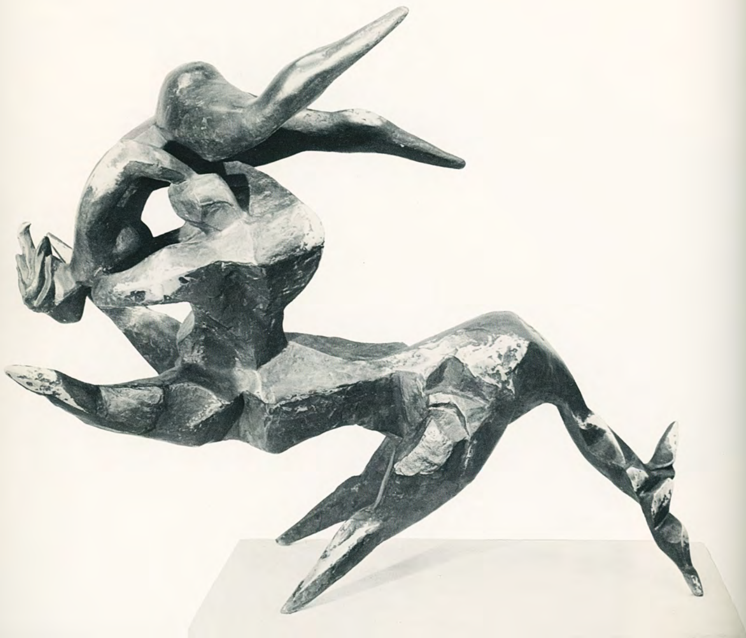
CENTAUR & LAPITH 1955-56 bronze, 36"l.