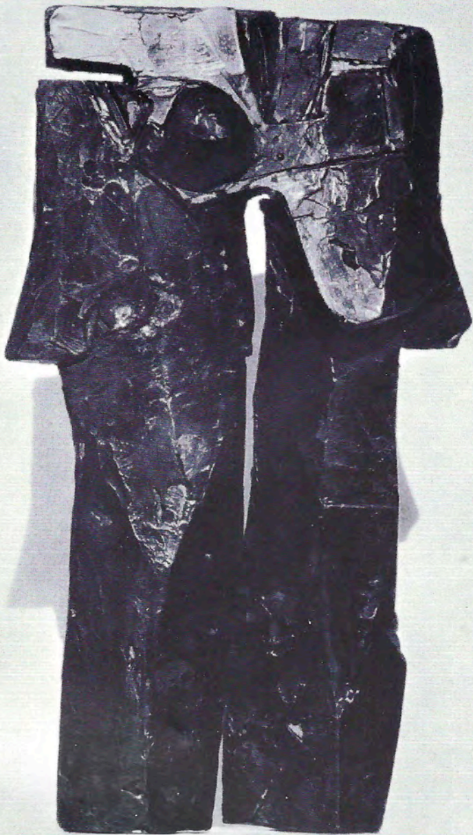
Pillars of Hercules, 1971-1972